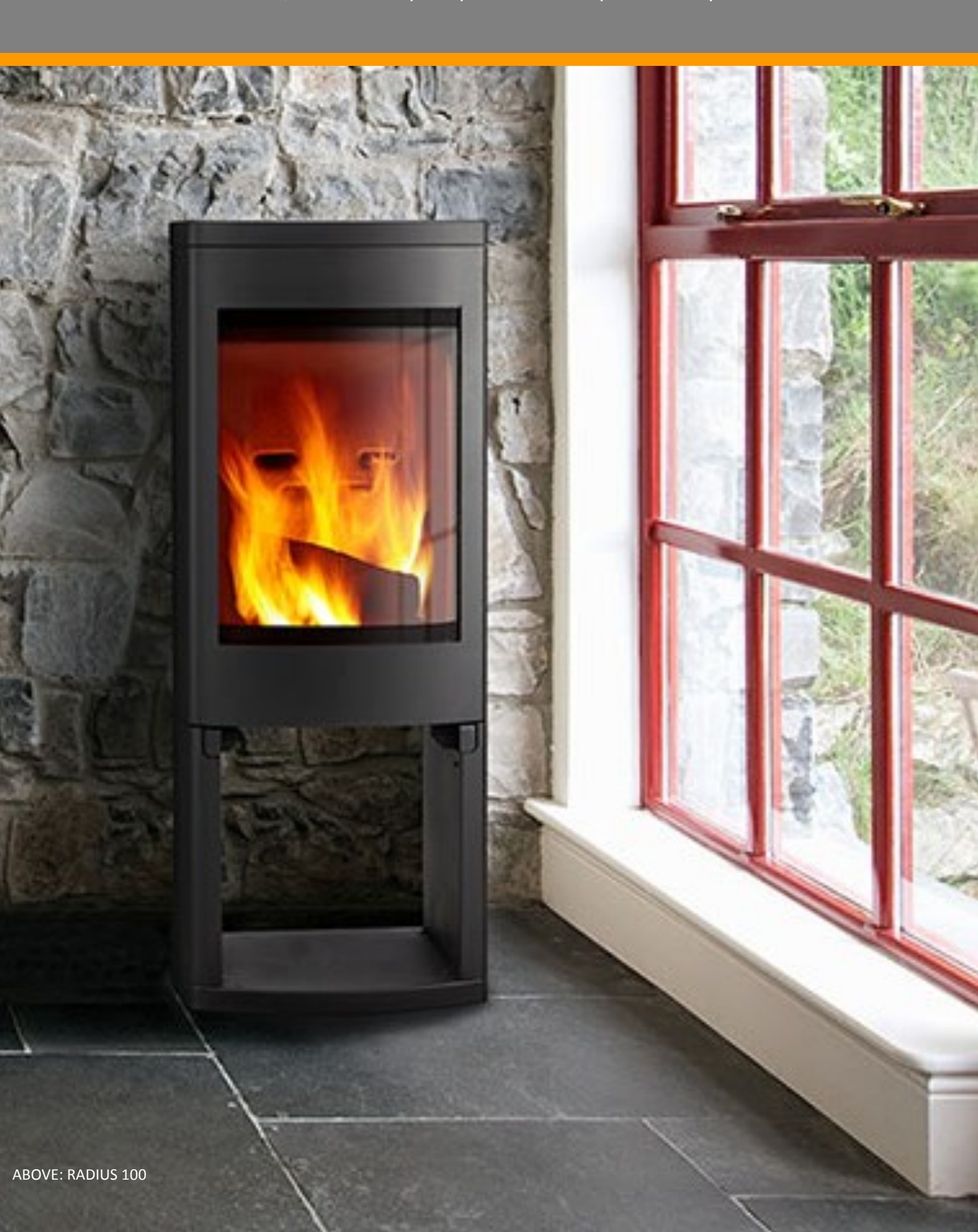
Heat & Glo Wood Stoves incorporate bold fires into clean, stylish designs. Advanced technology helps achieve high-efficiency performance and captivating flames. These sleek stoves can go places others cannot; slender footprint provides more placement possibilities.